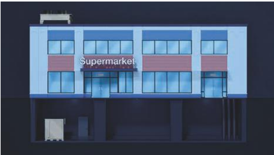
split indoor/outdoor installation