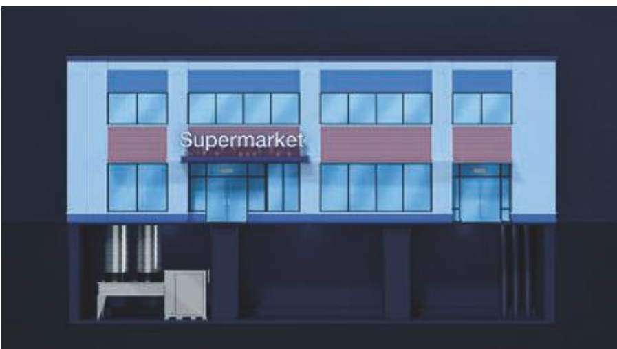
packaged indoor installation