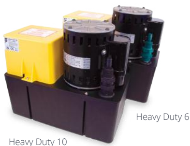
Heavy Duty 6